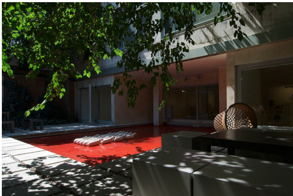
Fig. 1, Siamak Filizadeh, Sacrificial Lamb (overview), Tehran, 2009.