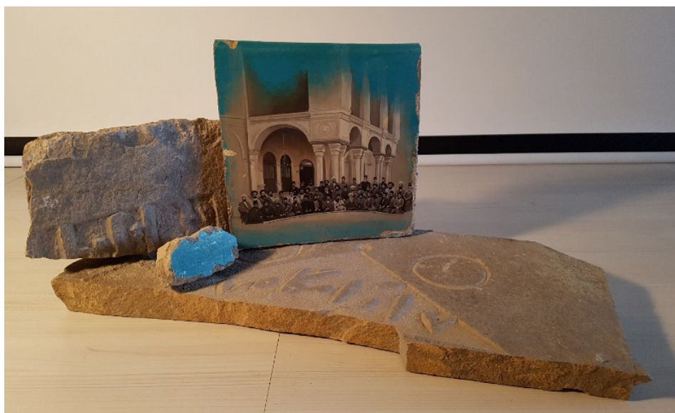
Fig. 9, Maryam Farzadian, Broken into a Hundred Pieces (The first Parliament of Iran), from exhibition Dialectic of Decay , Tehran, 2022.

monarchy. 43 Farzadian depicts key scenes from the Constitutional period, such as Mozaffar al-Din Shah signing the Constitutional Decree and the first consultative assembly in front of the parliament building, but also the consequent Russian-backed monarchist crackdown on constitutionalists in Tabriz and the imprisonment of parliament members.