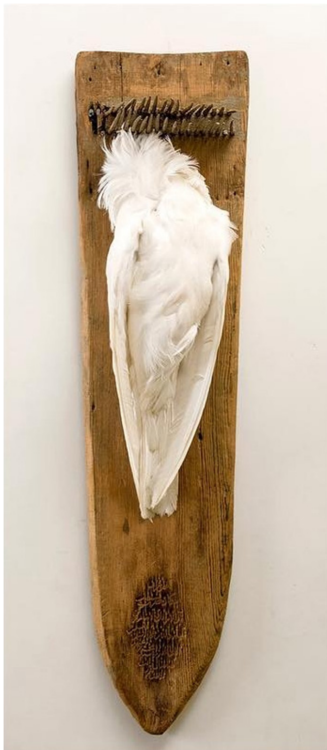
Fig. 6, Saleh Tasbihi, Birds from the Garden of Shah , Tehran, 2016.