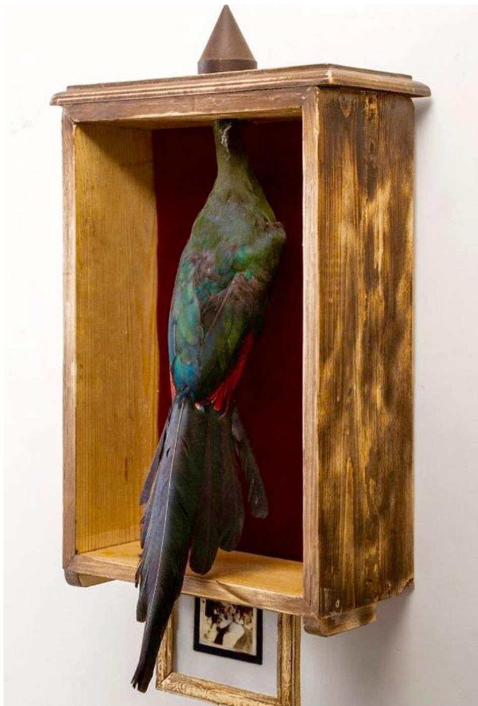
Fig. 5, Saleh Tasbihi, Birds from the Garden of Shah , Tehran, 2016.