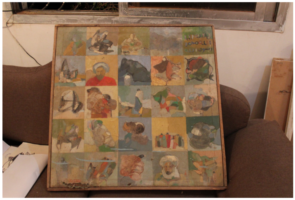
Figure 4 The painting at the moment of its first unveiling to me (squares mentioned above counted from right to left, up to down)

unmistakable signature in the bottom left corner, it nevertheless seemed to express exactly what the title of my book then suggested, the people of Sudan in various pious postures: from nature mysticism (squares 2, 8 and 13), to Sufi ceremony and motifs (squares 7 and 10), to the basic shari'a requirements of right worship (squares 1 and 17), to the ecstatic metaphor of the heavenly ascent of the mystic as a bird (square 23), as characterized most famously in the 12<sup>th</sup> century Nishapuri mystic Farīd al-Dīn 'Atār's "Conference of the Birds (Mantig al-Tayr)." It seemed perfect. The one problem was that it was falling apart—ripped, faded, caked in dust, paint chipping off—and I had no idea if it would survive the plane ride back to the United States. To make a long story short, I purchased the painting, got it home to the US, and began the process of having it cleaned, lightly "in-painted" and restored, and professionally stabilized, as we were in danger of losing it from the change in climate alone. When the restorers I had hired began to work on the painting, however, something rather unexpected, indeed remarkable, occurred, another unveiling of sorts beyond the emergence of the painting itself.