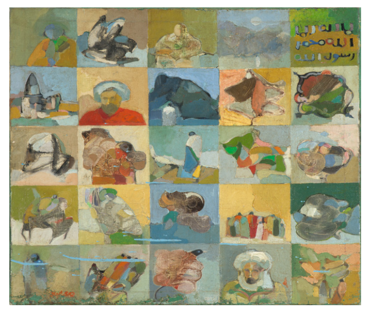
Figure 6 From the Diary of Shaykh Tāj al-Dīn al-Bahārī by Dr. Ahmad 'Abd al-'Āl, restored.

In "From the Diary of al-Shaykh Tāj al-Dīn al-Bahārī," now gloriously restored (Fig. 6), 'Abd al-'Āl imagines what the great shaykh must have seen in his travels as he spread his mystical order slowly across Sudan, day by day, image by image. A figure who sought to bring a renewed Islam to the masses, beyond mere legal observance alone, one that inspired an ecstasy so strong that even politicians would sacrifice their lives for it, was at the center of this painting. This was a figure who had sparked precisely the kind of civilizational renaissance for which 'Abd al-'Āl advocated, one who saw the profound relevance of the kind of aesthetic experience that Sufism promoted. Al-Bahārī's Sufism—at once civilization-transforming and God-centered, beautiful and dangerously powerladen, ecstatic and strategic—represented the very sort of potential that 'Abd al-'Āl hoped the art of the School of the One could embrace.