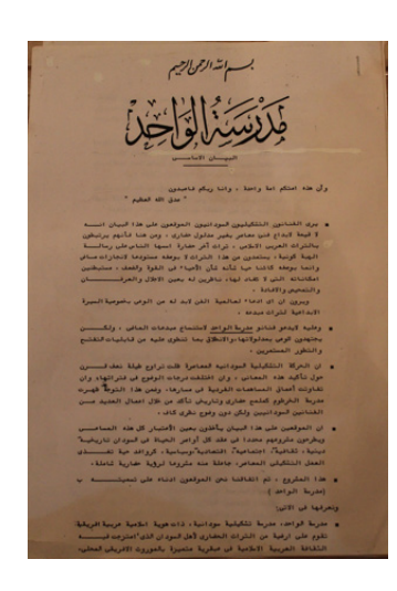
Figure 7 Cover page of the founding proclamation of the "School of the One"

A famous hadith discusses this elusive inner vision ( al-basīra al-bātina ) under the frame of al-ihsān . That the term, in its common articulations, is explained using the language of sight was a fact that could not have been lost on Abd al-'Āl. It is said that the Prophet was asked, "What is the meaning of al-ihsān ?" to which he replied, "It is to worship God as if you can see him ( ta'bud allāh ka'annak tarāhu ). And if you don't see him, he sees you."<sup>24</sup> According to Abd al-'Āl, it was both the artist and the mystic who equally had access to this world of beautiful forms. The School of the One held that an aesthetics coming out of the Sufi tradition— one that focused on al-ihsān , the vision of God, as the highest level of pious subjectivity—had to be reintroduced to both the contemporary Muslim (who had lost an interest in the fine arts) and the contemporary artist (who had lost an interest in Islam), and ultimately to Sudanese society as a whole (which needed a recalibration of its vision). As 'Abd al-'Āl wrote in the bayān (founding document, Fig. 7) that announced the inauguration of the School of the One: