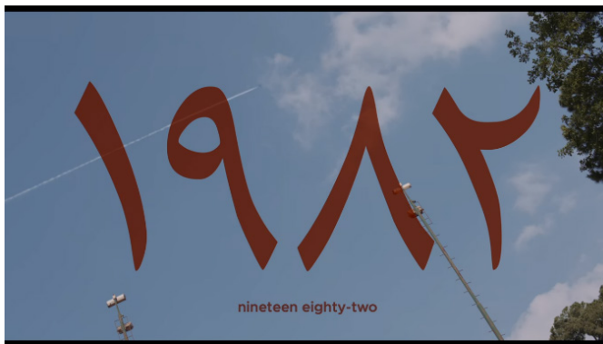
Figure 1: film title overlapping the sky's low angle wide shot

Oualid Mouaness made the simple choice of naming his feature film of 200 minutes, 1982 . In a bold move, and over a low angle wide shot of an aircraft crossing the Lebanese blue sky – a scene often to be seen throughout the story - Mouaness announces the film’s title using a big brown font on screen, perhaps as a statement to mark this year as one of the hardest in the contemporary Lebanese history.