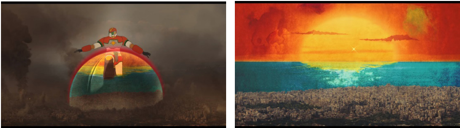
Figure 13-14 : Tigron transforming Beirut into a safe bubble

One cannot miss the fact that the appearance of the character Tigron was in a form of sketching, and then coloring. Spectators see Tigron being visually shaped. As he walks towards Beirut, Tigron is in the process of its actual creation. The sketching and coloring procedure finishes once he reached the battlefield and starts spreading his powers and colors all over Beirut. This choice is directly related to Wissam's imagination and talent. All along the film, Wissam draw Tigron in different situations. As a result, the saving operation of Beirut is a result of the child's on going imagination, making the desired safety bubble by Yasmin and Majid's mother come true.