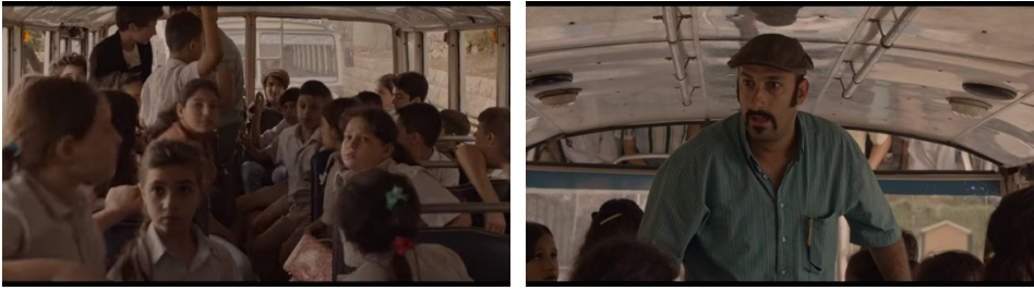
Figure 4 -5 : during the bus fight scenes