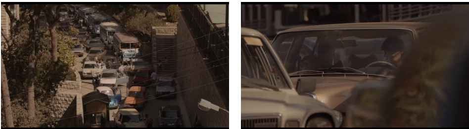
Figure 9-10 : Parents and buses stuck in the school as battles get tensed

Besides the surreal stars appearance, other story elements prepared Tigron's interference. In the last part of 1982, situation get tensed. Parents and students are trying to safely leave the school as they watch Beirut from the hill of Mount-Lebanon becoming a complete war zone. They are panicking and shouting hysterically in their cars while the Syrian and Israeli air forces fight over the city. Wissam's friend Majid gets re-assured by his mother. She comforts him by saying "it's okay sweetie. Only a bit longer and then we'll get to Solemar. Over there you can do whatever you want. It's safe over there". The kid then asks her: "Why is it safer over there?" she answers him back hesitatively: "Because... it just is".