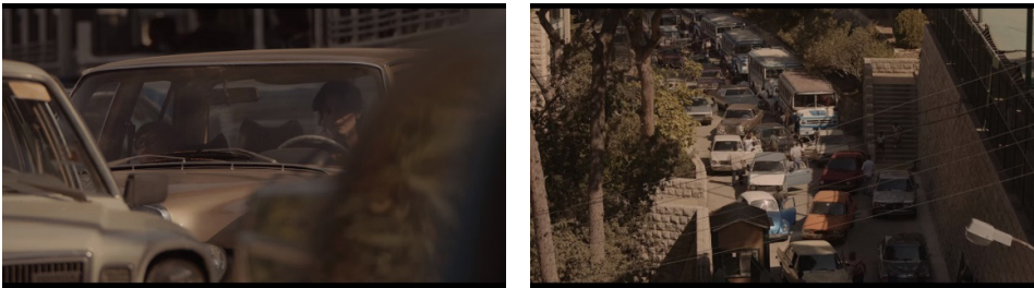
Figure 2 -3 : film scenes showing the characters stuck in Brumana High School

To be more specific, it is important to position the movie in its right historic context. On the 6 th of June 1982, the Israeli army did in fact enter Beirut. This attack, which took six hours only to be done, shocked the Lebanese people in a way that they never expected. After years of civil war, religious intolerance and inner divisions, this attack was the cherry on top. With lots of local and foreign parties fighting over the Lebanese lands, citizens found themselves being victim again of a bigger game, surrounded by foreign troops. This is expressed in 1982 with many suggestions in the film's scenes and lines. In a fictional one hour and a half long story, spectators accompany the film's characters as they found themselves stuck in the school, trying to escape towards safety, watching the attack from one of the Broumana hills in Mount-Lebanon.