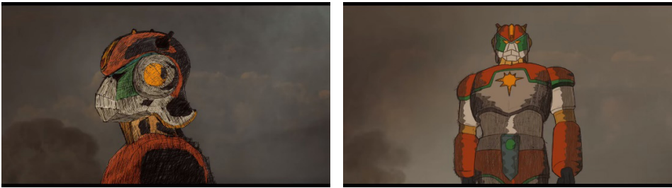
Figure 11-12 : Tigron ascending and walking towards Beirut

technique, giving the spectator the feeling of watching an 80's cartoonish series. Tigron, as named by Wissam, appears rising from the sea, walking towards Beirut, surrounding it with his colorful light. Through this image, it is clear that the director Oualid Mouannes pictured hope through this character based on a childish imagination. The drawing of the colorful sky overlaps the real one and then it produces light reflection on the faces of the kids, intertwining the imaginary with the real. Tigron's protective powers – as defined earlier by Wissam – transforms the city of Beirut into a safe bubble, colorful and hopeful, suggesting that the Lebanese capital is safe like the resort Solemar. Tigron walks away once his mission is accomplished.