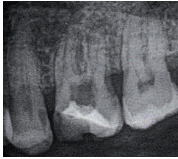
Fig. 1: Preoperative radiograph.

A diagnosis of incomplete previously initiated therapy with symptomatic apical periodontitis was