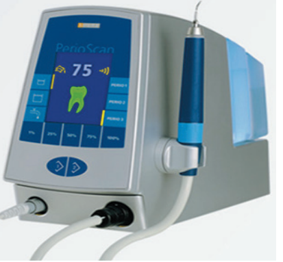
Fig. 2: PerioScan®.

time-consuming traditional laboratory procedures.