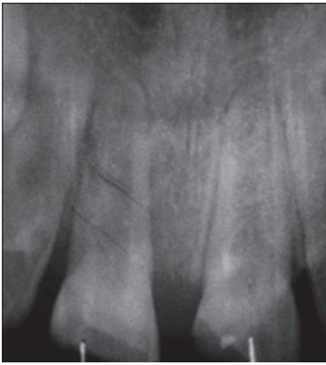
Fig. 1: Incomplete root formation with wide open apices.